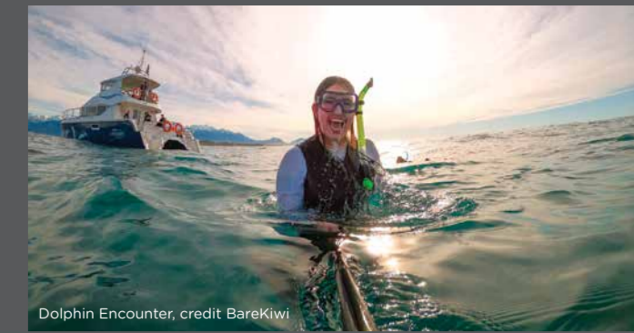
Dolphin Encounter

The artwork from this important collaboration between Waka Kotahi NZ & Te Rūnanga o Kaikōura has created an incredible legacy, one that encourages more people to investigate the rich history and culture of Kaikōura. Be sure to add time to your journey and explore the story that is Kaikōura.