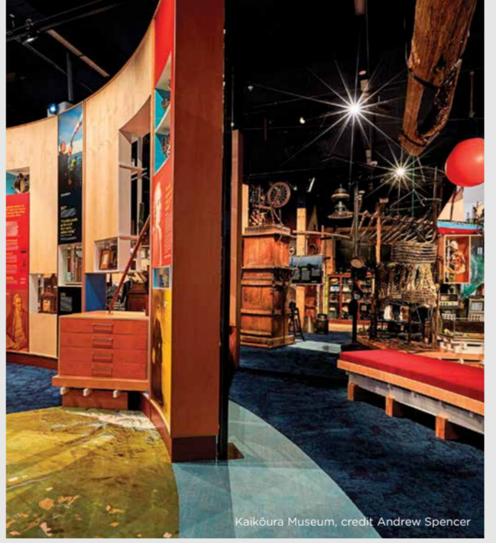
Kaikōura Museum

If you prefer to stay on land, there is quad biking, a lavender farm, mountain biking, cycling, and walking tracks to enjoy. Alternatively, you can explore Kaikōura's history at Fyffe House and the Museum, or immerse yourself in cinema & arts at The Mayfair, just to name a few.