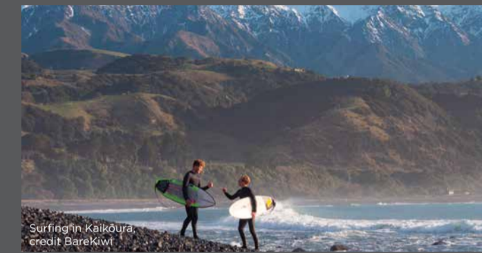
Stirring in Kaikōura