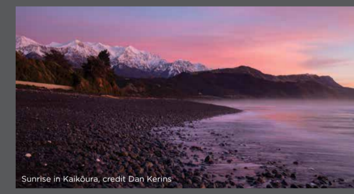
Sunrise in Kaikōura