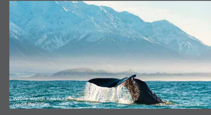
Whale - West of Kaikōura

TIAKI MEANS TO CARE FOR PEOPLE AND PLACE. THE TIAKI PROMISE IS A COMMITMENT TO CARE FOR NEW ZEALAND, FOR NOW AND FOR FUTURE GENERATIONS.