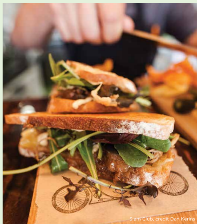
Siam Club

We have several annual events such as the Kaikōura Hop (a premier car show), The Kaikōura Whale Run (1/2 marathon, 12km, 5km & Marafun), 48 Hour photography event, The Kaikōura Adventure Race (24, 12, 6 & 3 hour course lengths on offer), The A&P Show, The Kaikōura Races and Crayfest (A festival that celebrates Kaikōura's most famous kaimoana, the Crayfish) + more. Be sure to put Kaikōura on your event schedule this season.