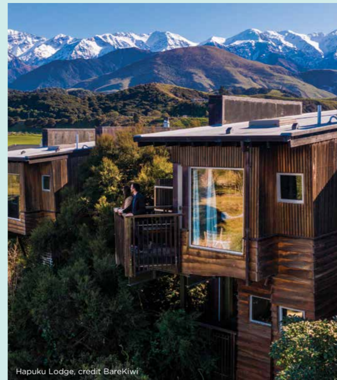
Hapuku Lodge

On the 14th November 2016 a magnitude 7.8 earthquake struck North Canterbury, causing significant damage to buildings and infrastructure in Kaikōura and surrounds. Today, Kaikōura has come out the other side of the earthquake as a strong, resilient community. To find out more head along to the Kaikōura Museum.