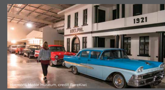
Harmon's Motor Museum