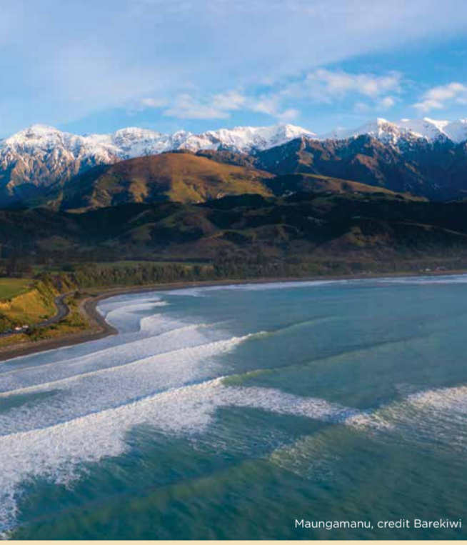
Maungamau