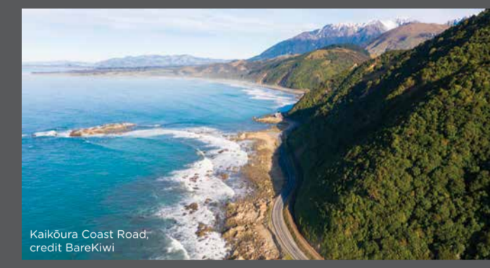
Kaikōura Coast Road, credit BareKiwi