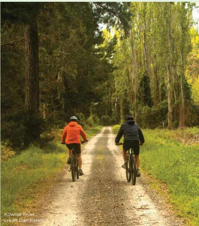
Kowhai River

We invite you to discover what makes Kaikōura so unique - a place that's one of a kind; unlike anywhere else.